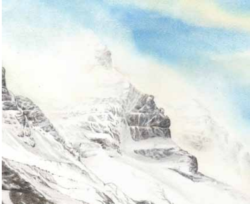
(Detail) Steadfast, Watercolor, 29in x 21in, 72.5cm x 52.5cm

Jeremiah 16:19 O LORD, my strength and my fortress, my refuge(1) in time of distress, to you the nations will come from the ends of the earth and say, “Our fathers possessed nothing but false gods, worthless idols that did them no good.